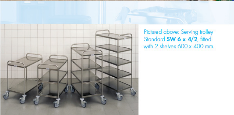
Pictured above: Serving trolley Standard SW 6 x 4/2, fitted with 2 shelves 600 x 400 mm.